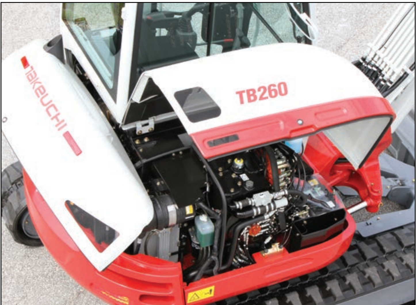
Large lockable service hoods provide vandalism protection and outstanding maintenance access.

Additional features include automatic idle, heavy duty cooling module, and a large wraparound counterweight that protects engine components from damage.