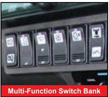
Multi-Function Switch Bank