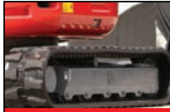
Triple Flanged Track Rollers