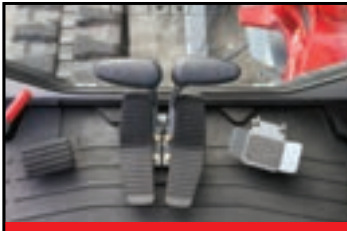
Large Floor with Foot Rest