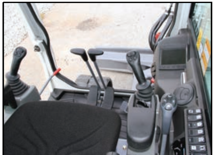
Automotive Styled Interior

*Functions may not be available in all countries, so please consult your Takeuchi dealer for details.