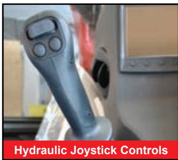
Hydraulic Joystick Controls